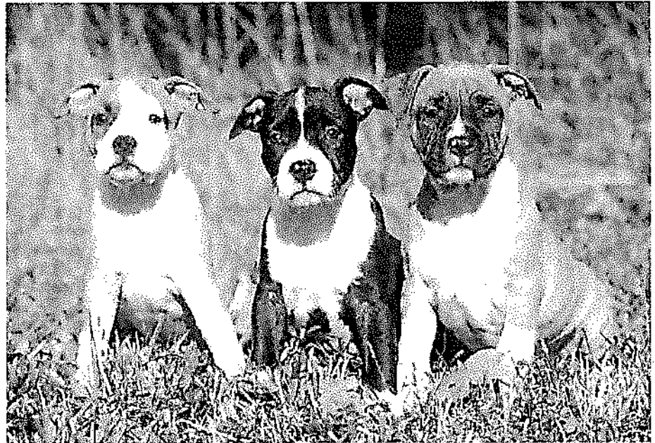
AMERICAN STAFFORDSHIRE TERRIERS - ISABELLA FRANCAIS CANC

Strict enforcement of animal control laws (such as leash laws) and guidelines that clearly define dangerous behavior in all breeds are more effective in protecting communities from dangerous animals. Dangerous dog guidelines should establish a fair process by which a dog is deemed “dangerous” or “vicious” based on stated, measurable actions , not merely based on breed. These laws should also impose appropriate penalties on irre-